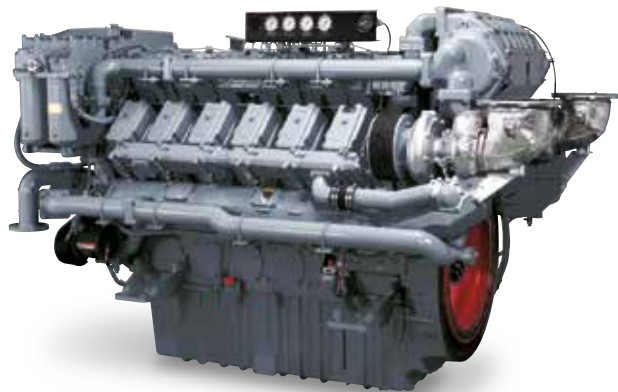
Engine only / Front view